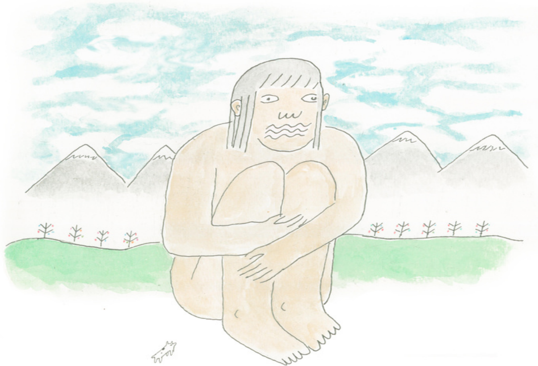
Ramen watercolor, ink 22,86 x 30,48 cm 2013

RYUJI TSUKAZAKI HAD WOKEN UP OUTSIDE HIS HOUSE BEFORE. HE HAD EVEN WOKEN UP OUTSIDE HIS HOUSE NAKED BEFORE. BUT WAKING UP NAKED ON TOP OF HIS HOUSE WAS A FEELING ALTOGETHER NEW TO THE MAN WHO WOKE UP A GIANT.