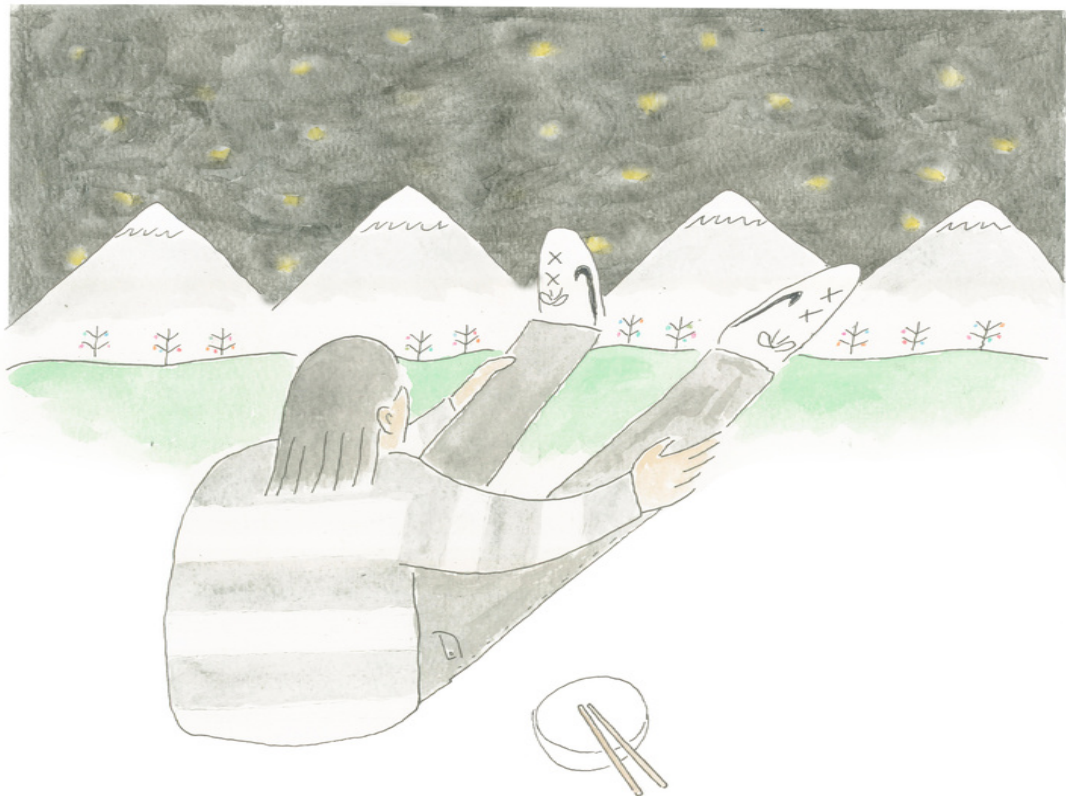
Untitled (aus Ramen) 2013