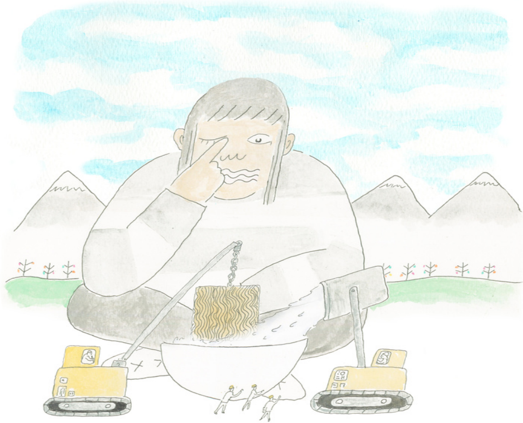
Untitled (aus Ramen) 2013

AS HE WATCHED IT ALL COME TOGETHER HE NEARLY CAME TO TEARS.