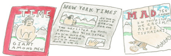
Untitled (aus Ramen) watercolor, ink 22,86 x 30,48 cm 2013

OF COURSE NEWS OF THE GIANT FROM JAPAN WAS BIG NEWS ALL AROUND THE WORLD, AND WAS FEATURED ON ALL OF THE MOST IMPORTANT PUBLICATIONS.