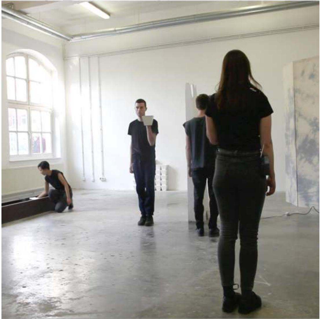
Formation HO X3 40/012 Performance 2017