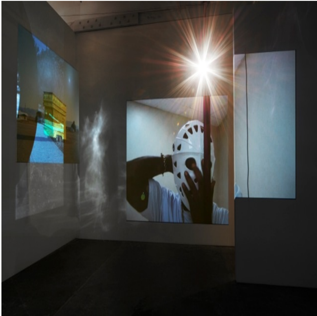
Frances Scholz/Mark von Schlegell Amboy Installation, CCA Wattis Institute of Contemporary Art, San Francisco Installation View 2015