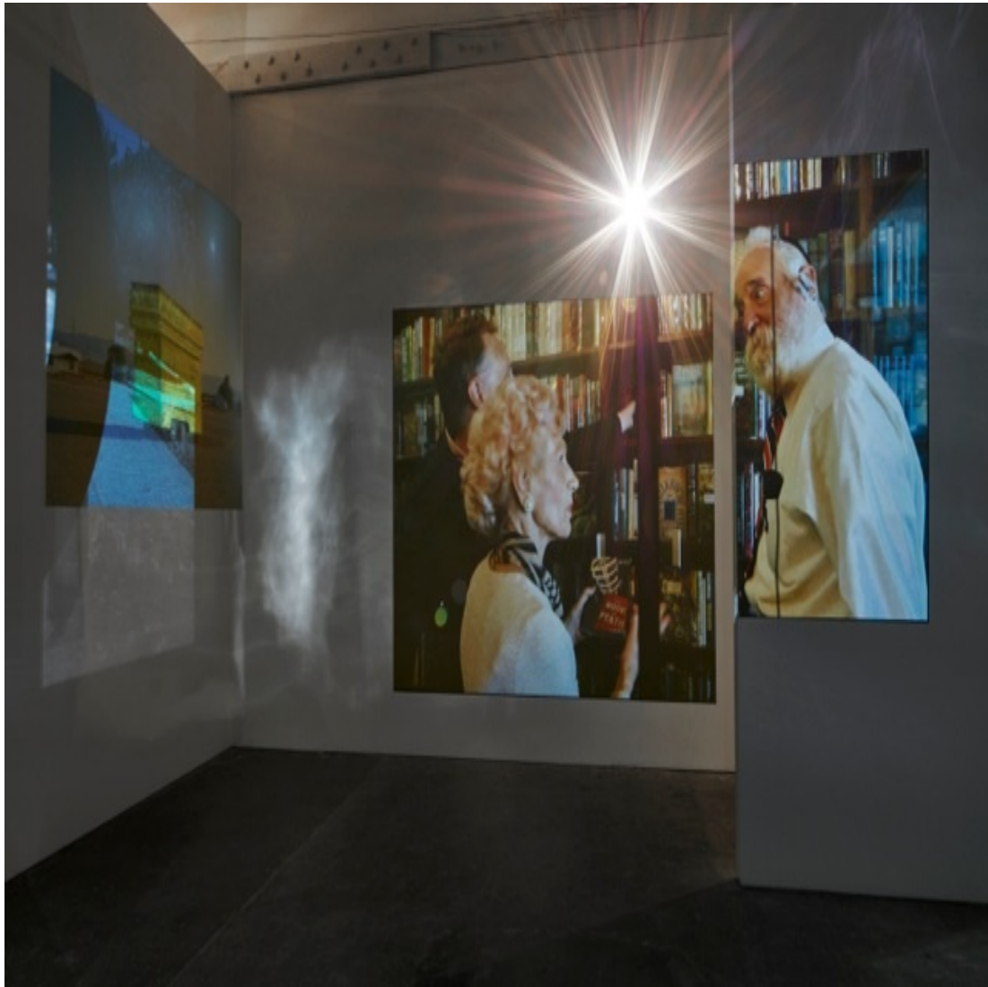
Frances Scholz/Mark von Schlegell Amboy Installation, CCA Wattis Institute of Contemporary Art, San Francisco Installation View Maße variabel 2015