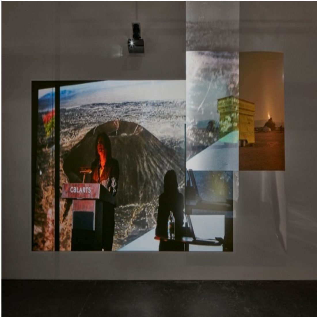
Frances Scholz/Mark von Schlegell Amboy Installation, CCA Wattis Institute of Contemporary Art, San Francisco Installation View 2015