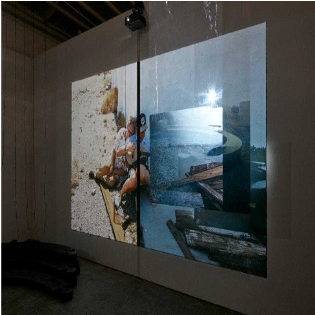
Frances Scholz/Mark von Schlegell Amboy Installation, CCA Wattis Institute of Contemporary Art, San Francisco Installation View Maße variabel 2015