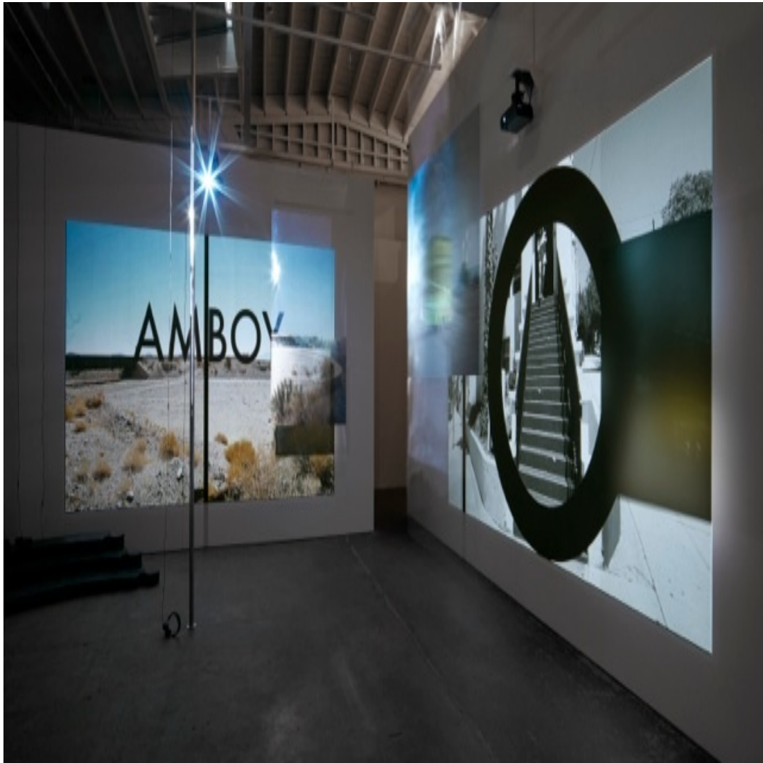
Frances Scholz/Mark von Schlegell Amboy Installation, CCA Wattis Institute of Contemporary Art, San Francisco Installation View Maße variabel 2015