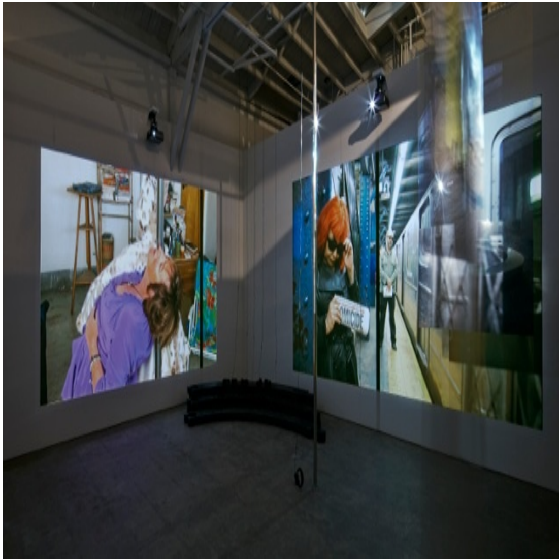
Frances Scholz/Mark von Schlegell Amboy Installation, CCA Wattis Institute of Contemporary Art, San Francisco Installation View Maße variabel 2015