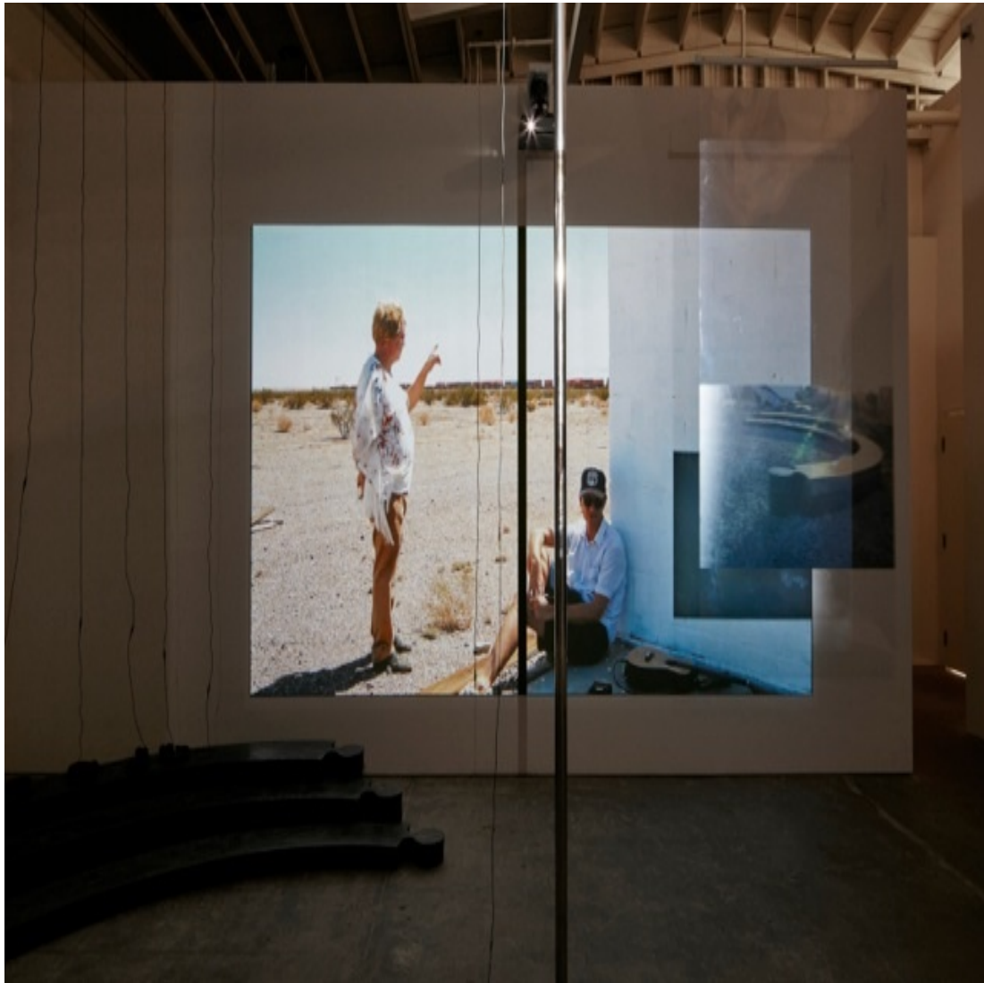
Frances Scholz/Mark von Schlegell Amboy Installation, CCA Wattis Institute of Contemporary Art, San Francisco Installation View Maße variabel 2015