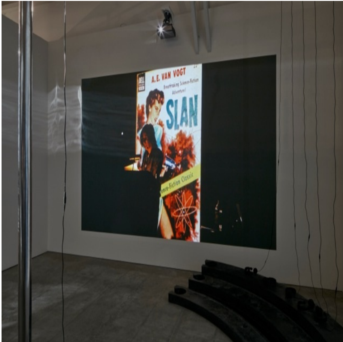
Frances Scholz/Mark von Schlegell Amboy Installation, CCA Wattis Institute of Contemporary Art, San Francisco Installation View Maße variabel 2015