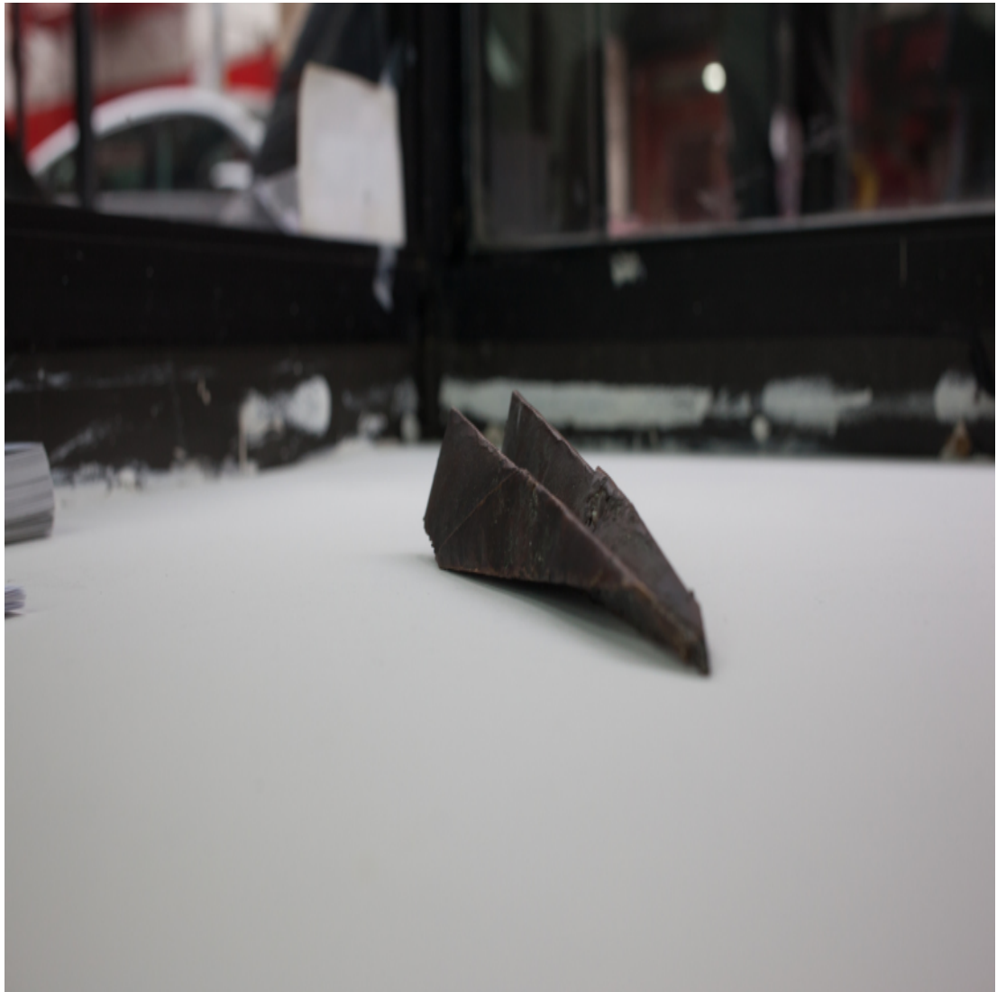
Christopher Gerberding Avion Adult (from Kennen sie Turner) sculpture bronze variable in size 2017