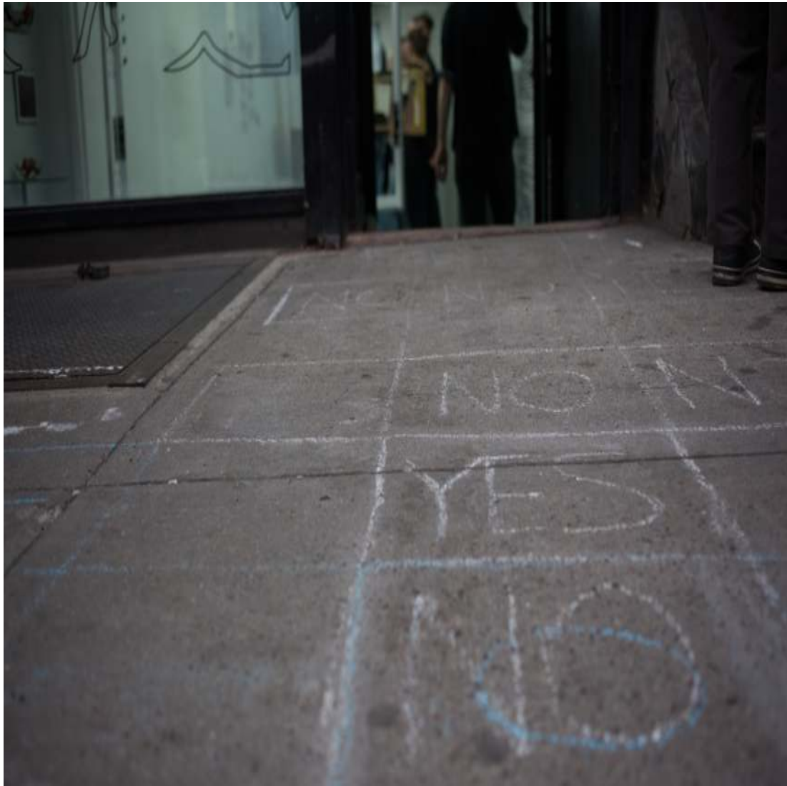
Christopher Gerberding Please write down your title (from Kennen sie Turner) drawing Chalk on asphalt variable in size 2017