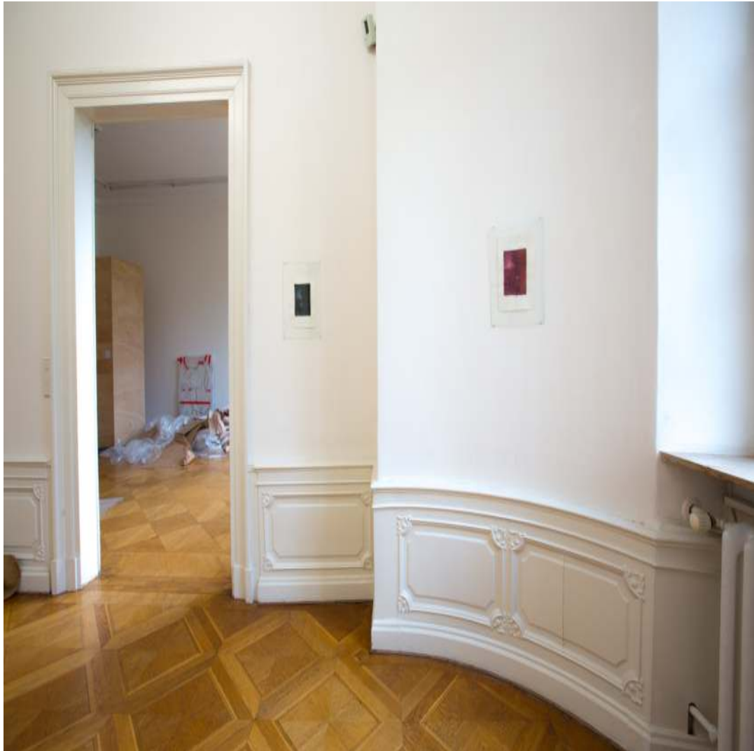
Young and Ignorant ink Paper 11¼ x 8¼ inch / 30 x 21 cm 2017