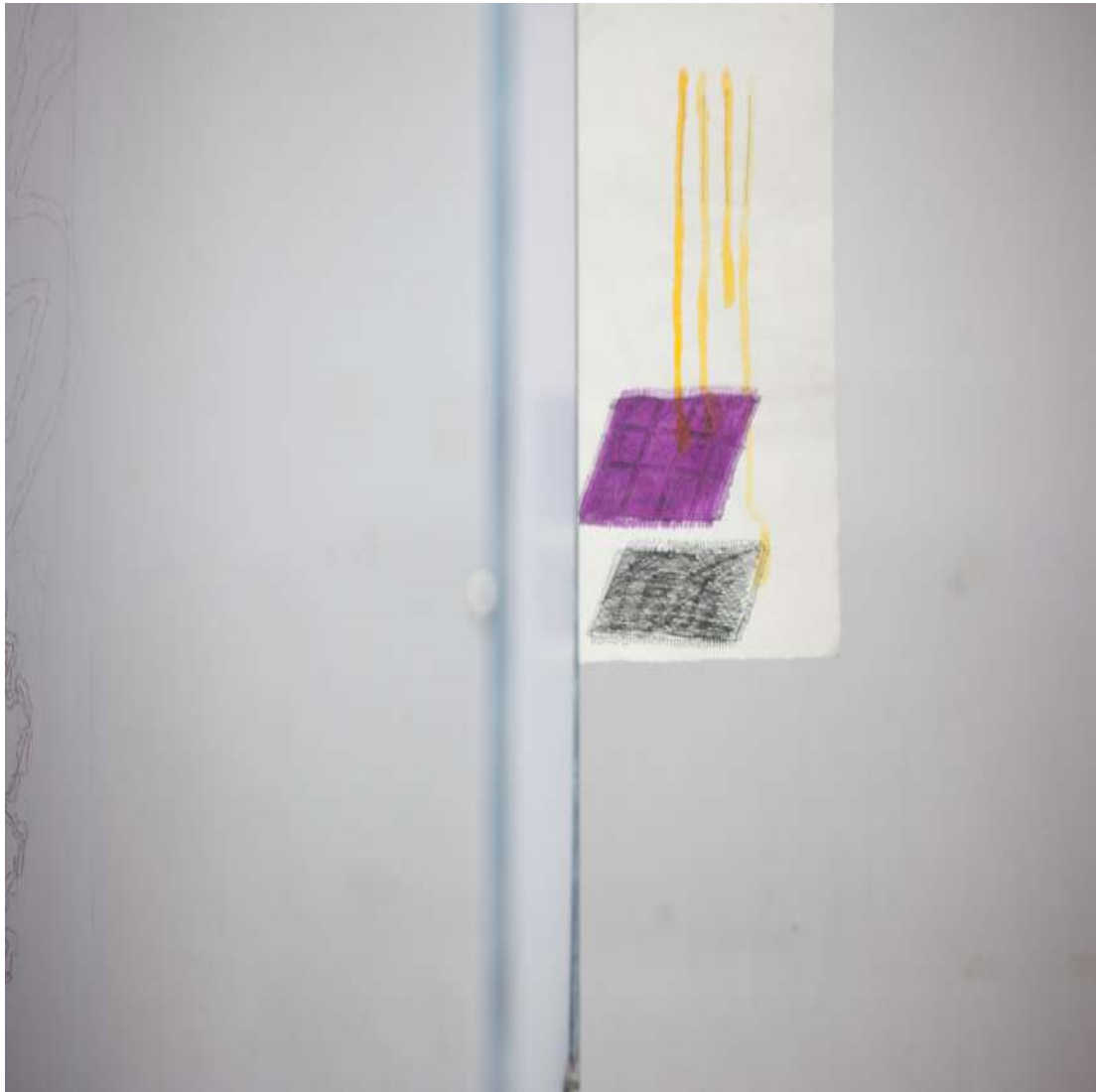
Take me through the Acid Rain (from Kennen sie Turner) drawing Ink on paper 2017