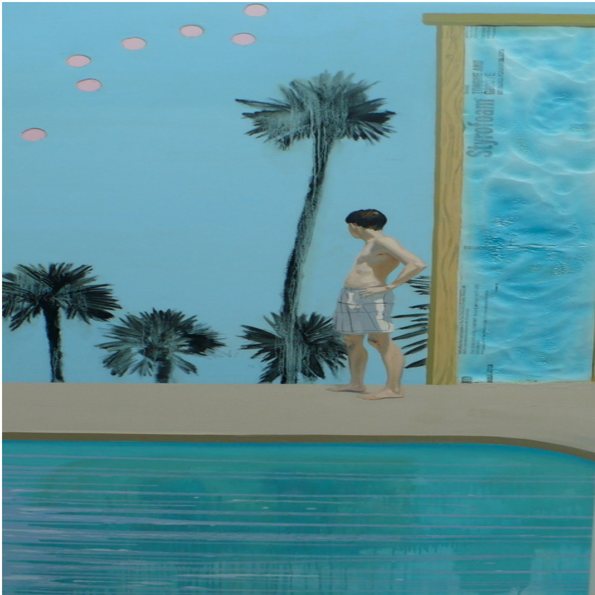
Seb Conley contemplating the big stroke (aus Mallorca) oil/acrylic charcoal on canvas 78,74 × 36,22 cm 2010