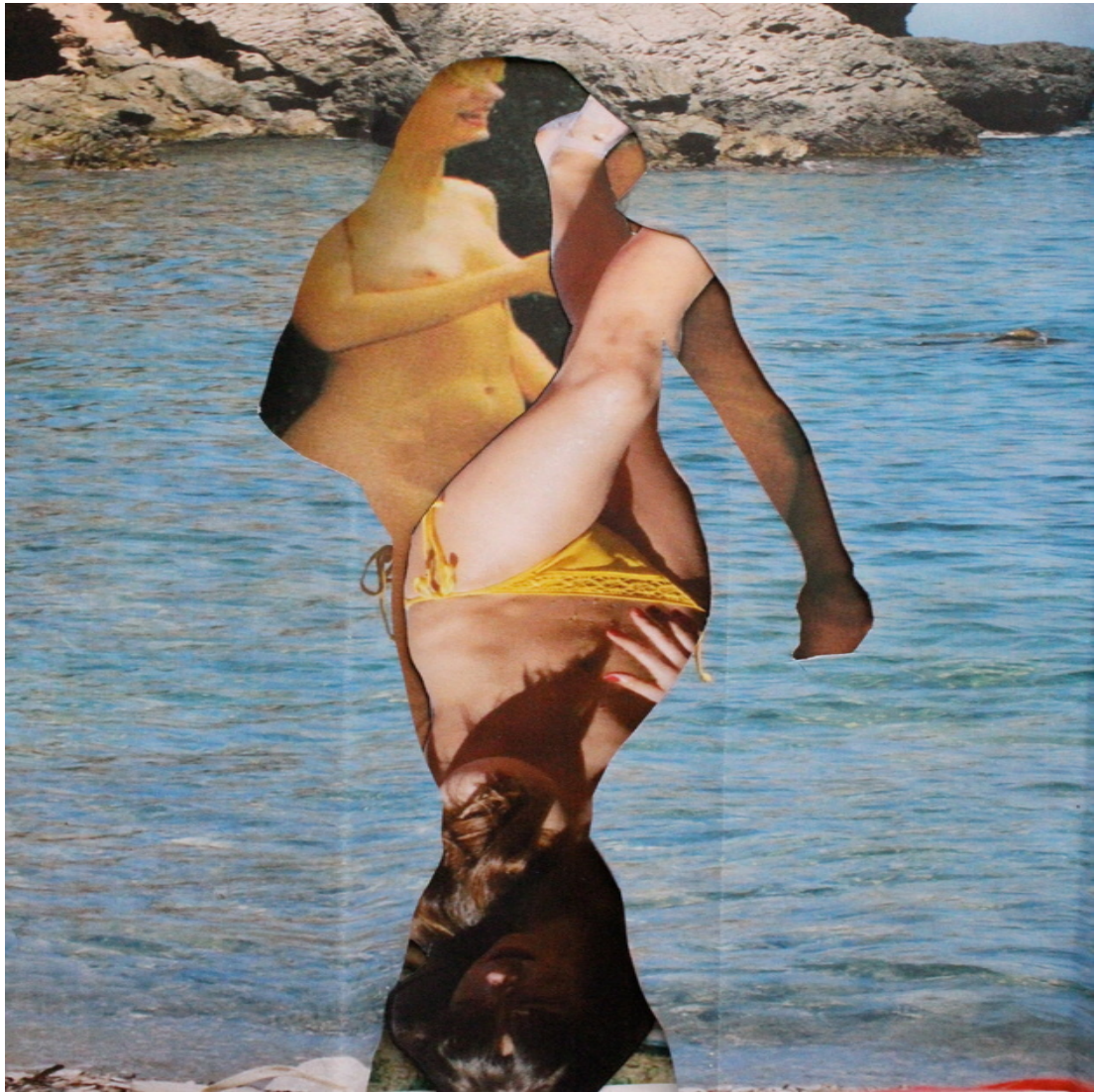
Mallorca photo collage 2011