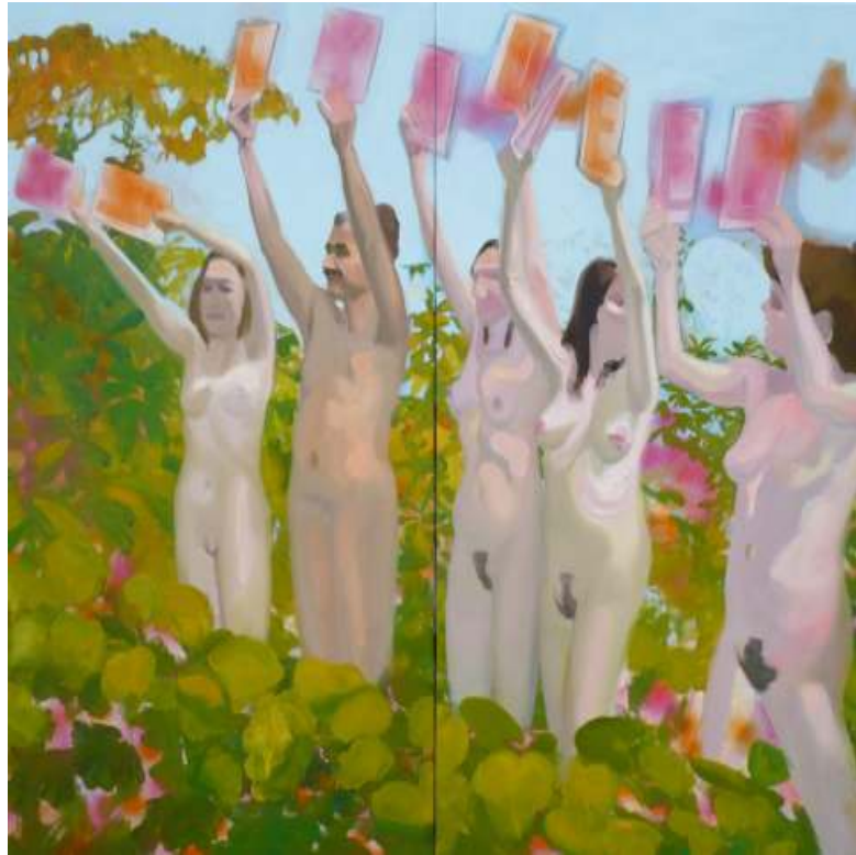
Nudists (aus Andromeda Discount Galaxy) oil/acrylic charcoal on canvas 48,03 × 55,12 cm 2010