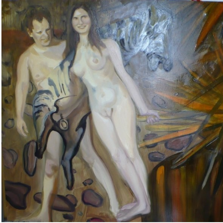
Zebraed (aus Andromeda Discount Galaxy) oil/acrylic charcoal on canvas 48,03 × 48,03 cm 2011