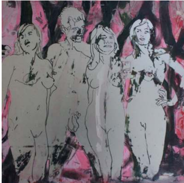
solutrains (aus Andromeda Discount Galaxy) oil/acrylic on aluminum 18,11 × 18,11 cm 2011