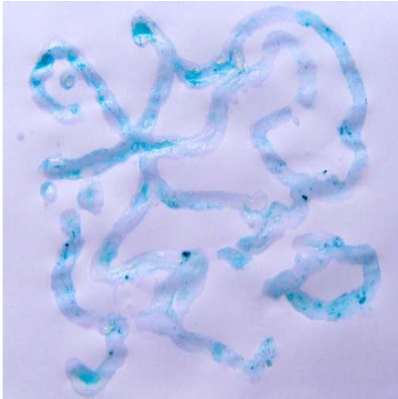
transformed bacteria #1 (aus transformed #1) drawing paper; luria broth, transgenic bacteria 27,94 × 20,32 cm 2012