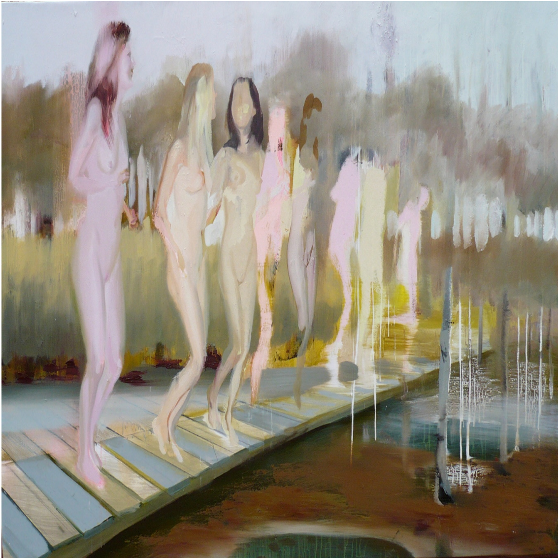
Nudist Females trying to stay warm on a January Day (aus Andromeda Discount Galaxy) oil/acrylic charcoal on canvas 27,56 × 70,87 cm 2010