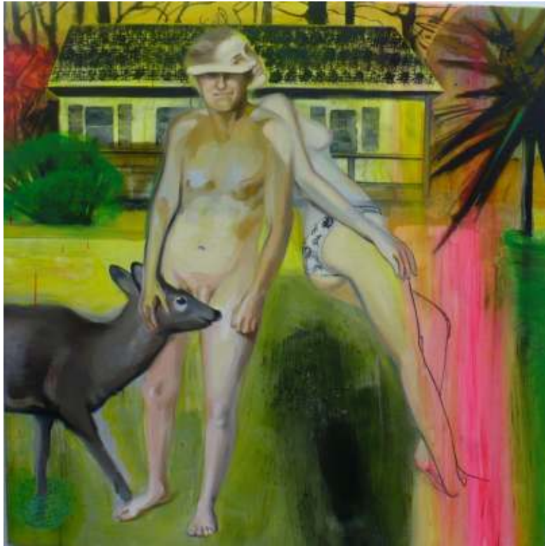
We have in mind perhaps a place of our own (aus Andromeda Discount Galaxy) oil/acrylic marker on canvas 48,03 × 48,03 cm 2010