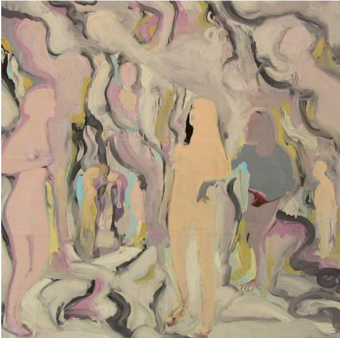
Andromeda Galaxy (aus Andromeda Discount Galaxy) painting acrylic on board 121,92 × 121,92 cm 2011