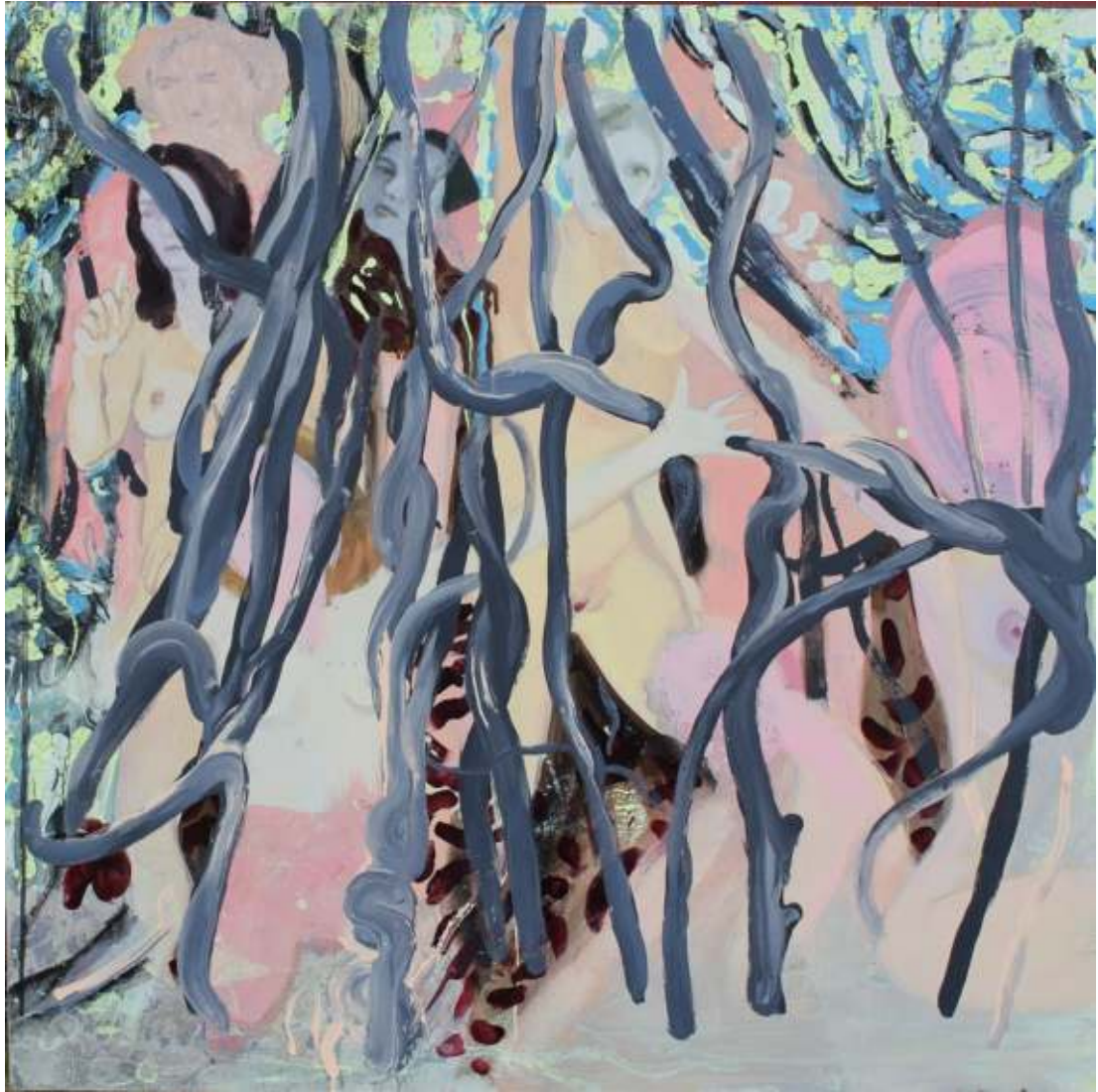
Nude is like a Tree (aus Andromeda Discount Galaxy) acrylic, oil 2011