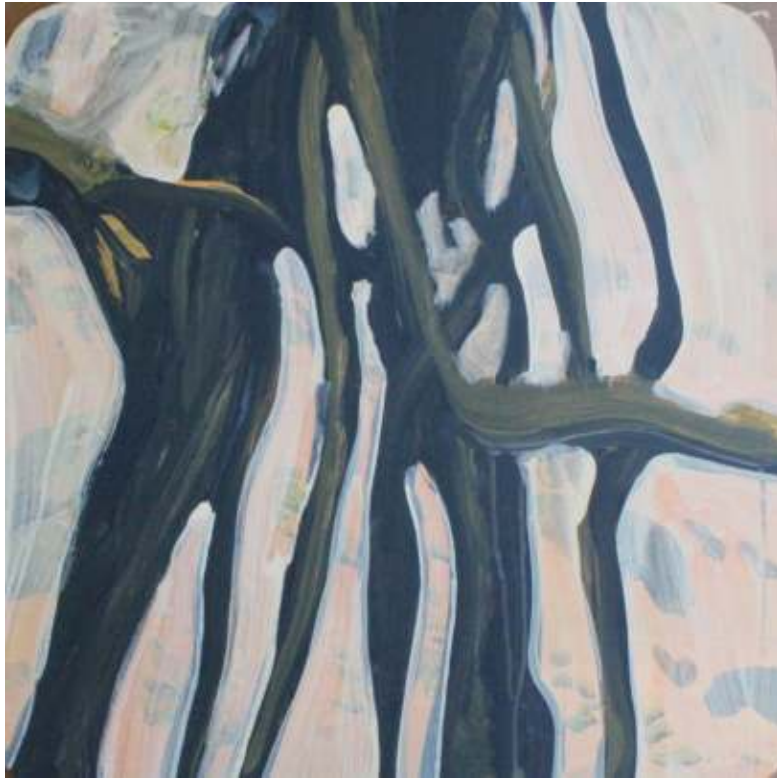
Untitled (aus Andromeda Discount Galaxy) oil/acrylic on aluminum 17,72 × 17,72 cm 2011