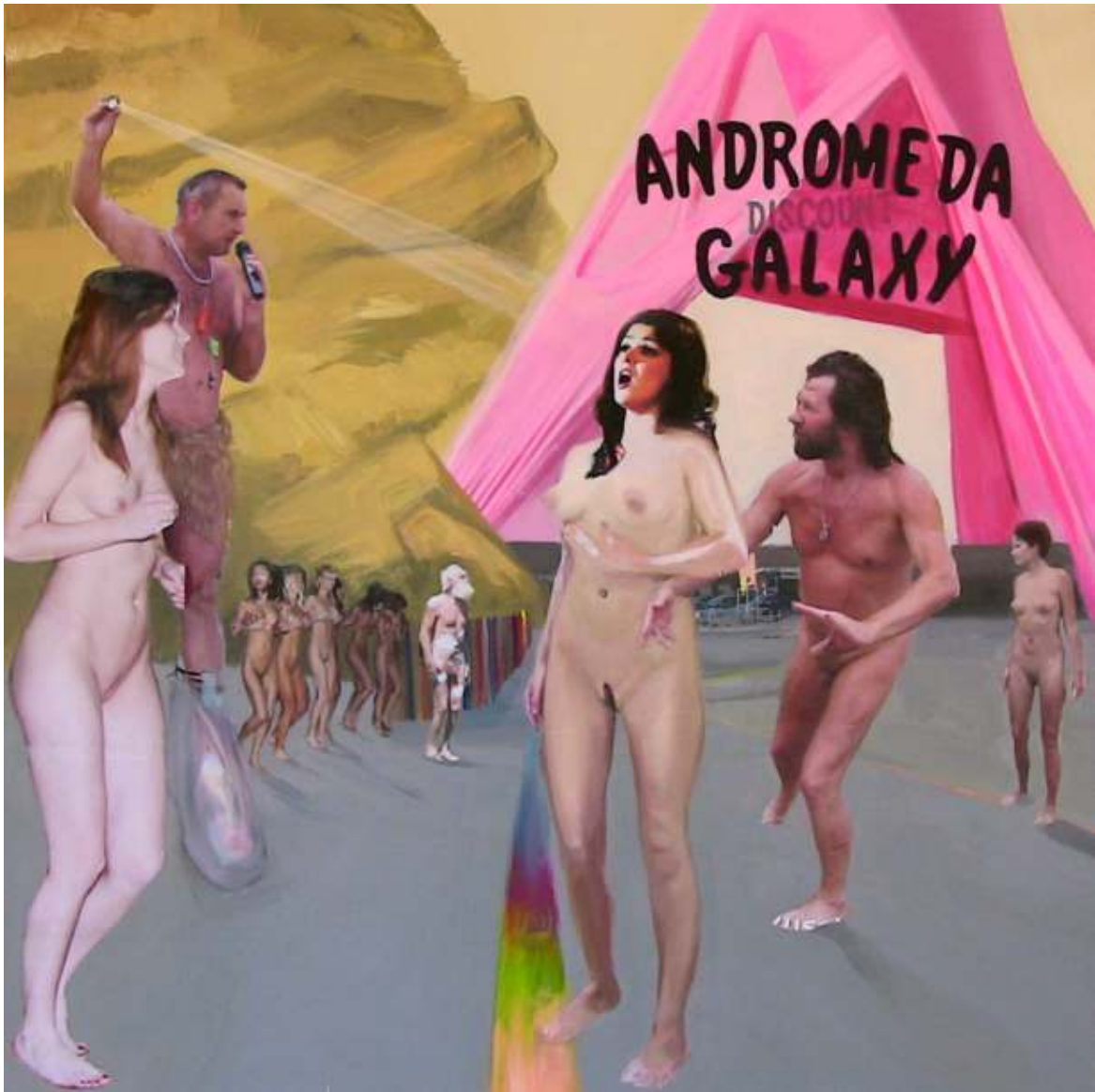
Andromeda Discount Galaxy painting acrylic, paper, printed ink 121,92 × 121,92 cm 2011