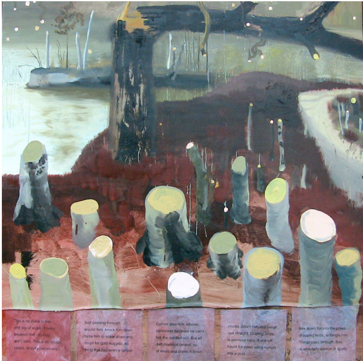
Place to Live acrylic, oil, paper 122 x 122 cm 2011